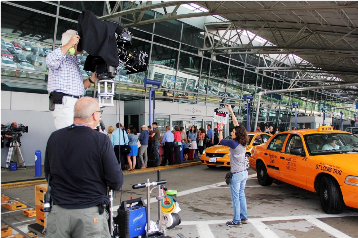
Photo from the Lambert International Airport set of the feature film The Layover