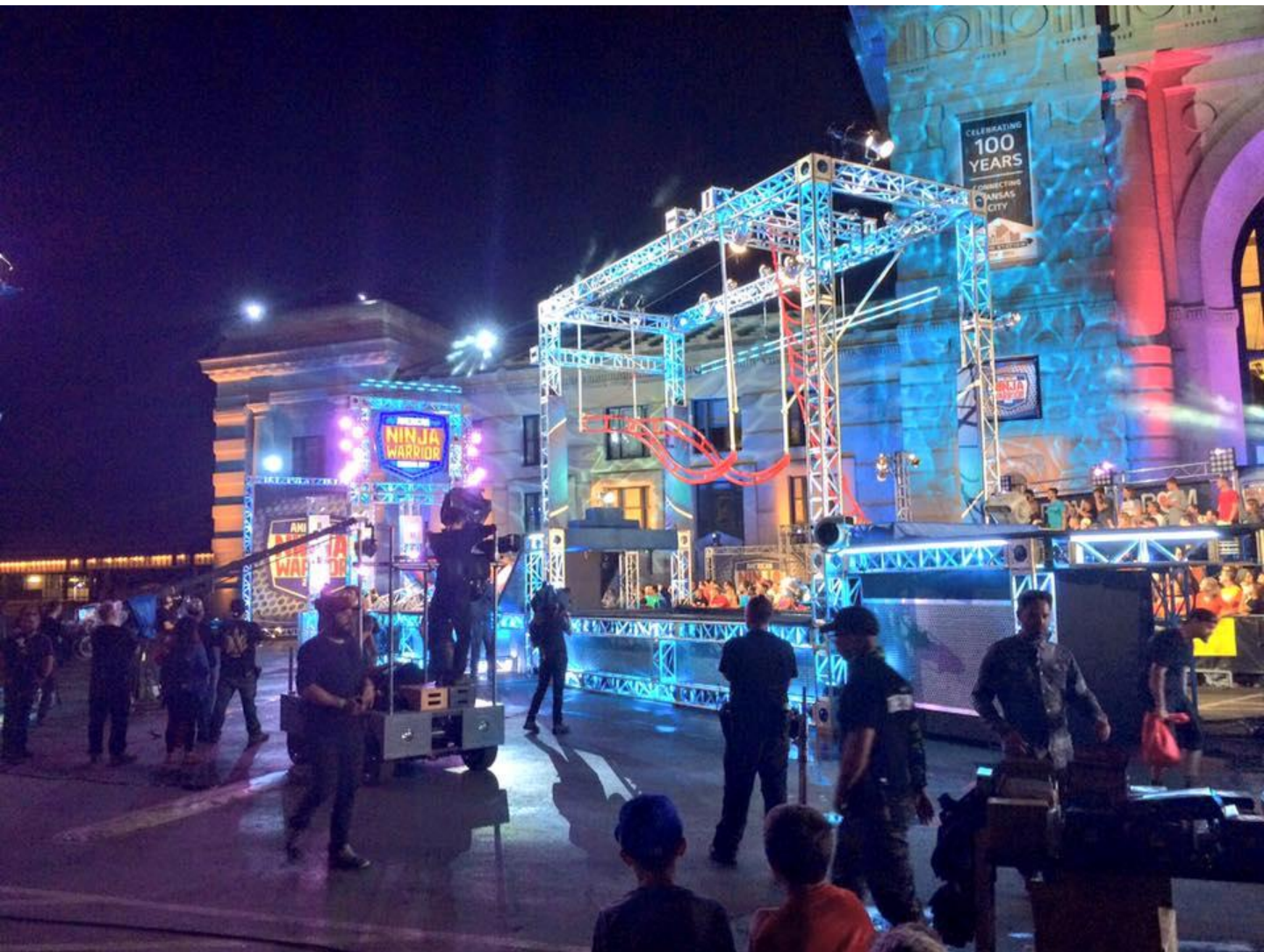
Photo on the Kansas City Union Station set for the NBC TV series American Ninja Warrior